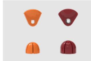
Juice extraction kits