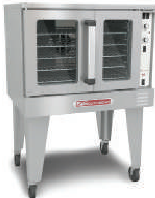
(PCR-1E shown with optional casters)

140°F to 500°F solid state thermostat and 60 minute mechanical cook timer.