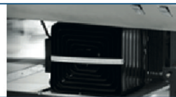
Easy Access to Compressor