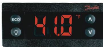
Electronic Digital Controller