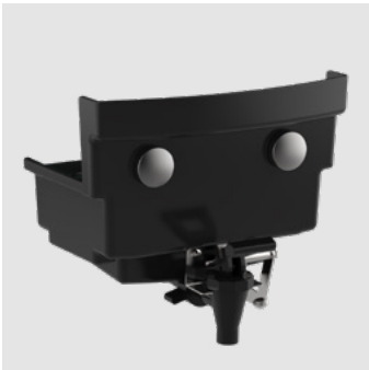
Injected Self Service Tray