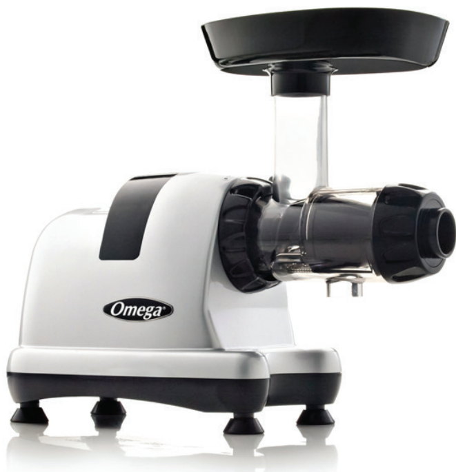
Model 8007/8008 Int'l: J8227/J8228 Masticating Juicer